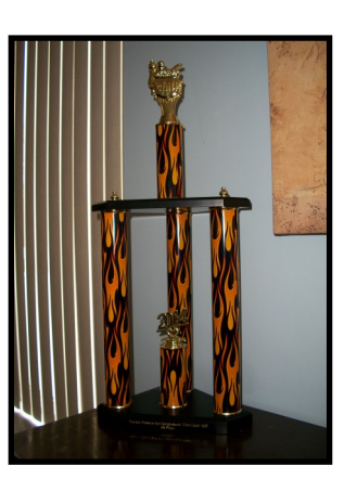
The 1st Place Chili Cook-off Trophy